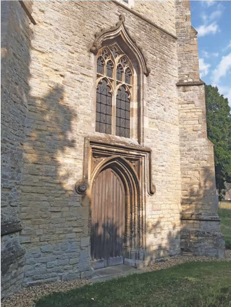
St Mary, Bozeat

With thanks to all those who contributed to this Report.