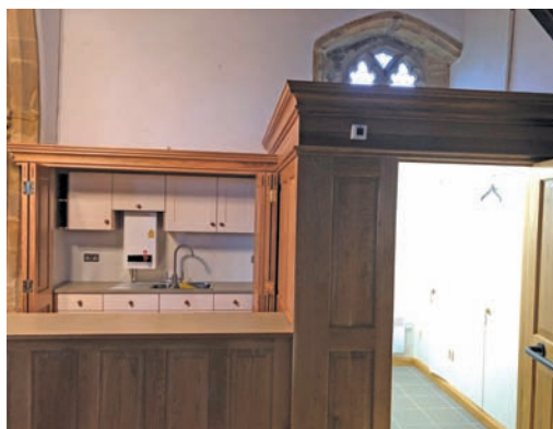
New servery and toilet facilities at St Denys, Ravensthorpe